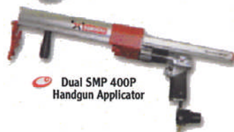
Dual SMP 400P Handgun Applicator